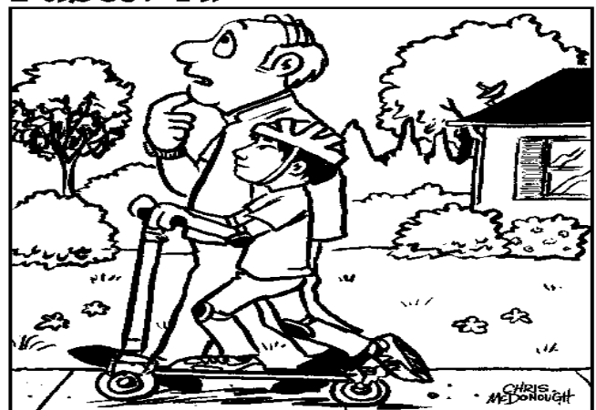
"No, Masao, as far as I know, they don't make a raisin-bread version of the hosts."

© 2002 World Library Publications, a division of J. S. Paluch Co., Inc.