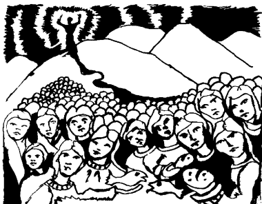
Jesus took the loaves, gave thanks, and distributed them